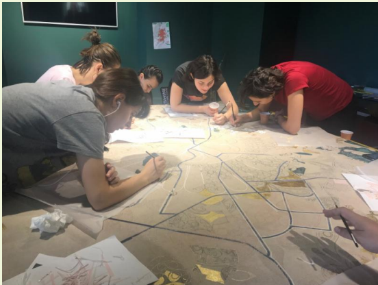
At work in Pristina, Museum of Kosovo: Kosovo Albanians, Serbs, Roma, Ashkali Egyptians, Armenian artists, with French Moroccan and American participants.

The Cities of Peace collection promotes a belief in the critical role of cities in sustaining what is creative and hopeful in civilization. It inspires those who create and who view these works of art to act to protect, develop and improve urban centers throughout the world. Art and Culture Matter: they engage in the essential dialogue about cultural heritage, preventing the destruction of civilization, protecting cities, and rekindling the human spirit.