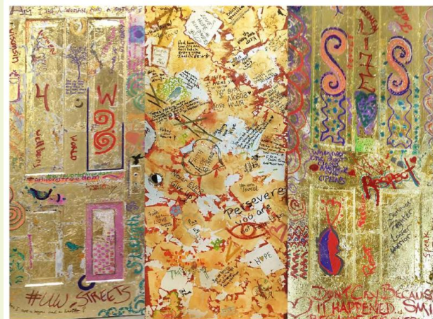
Golden Doors share the message of hope.