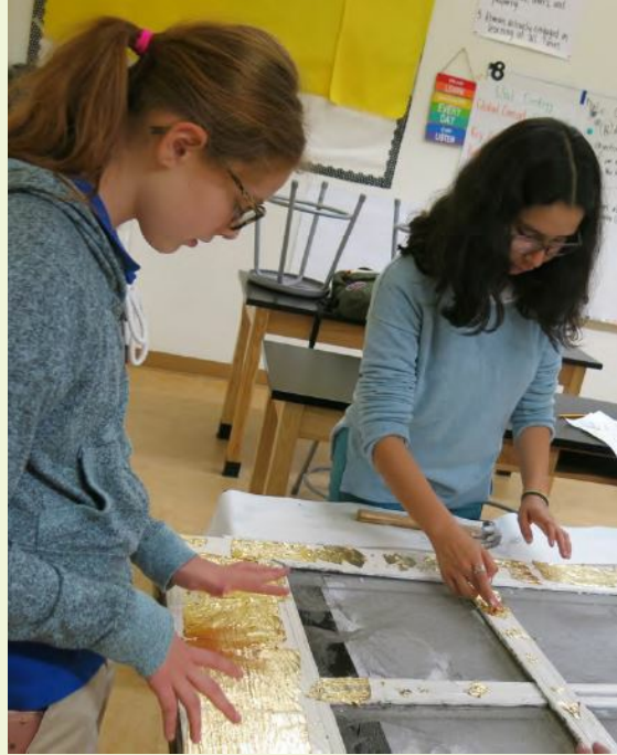
Students find joy in gilding the Golden Doors.