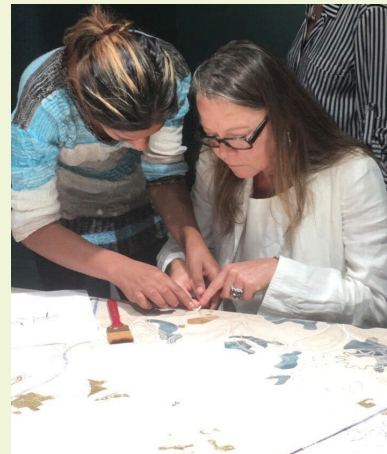
Young Kosovo Roma woman teaching the head of the United Nations Development Program.